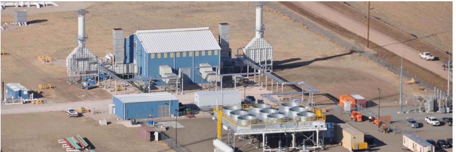
Trailblazer Waste Heat to Power Project in Northeastern Colorado

ENVIRONMENTAL BENEFITS: 27,600 tons of CO 2 , 34,500 kg of NO x , and 124,200 kg of SO 2 saved each year